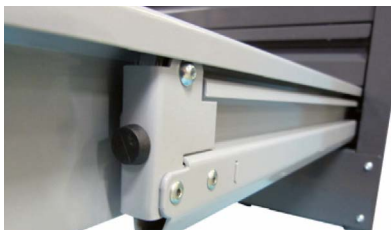
Steel bearing runners

Paintwork is conservation quality powder coated which does not off gas making the cabinet archivally safe.