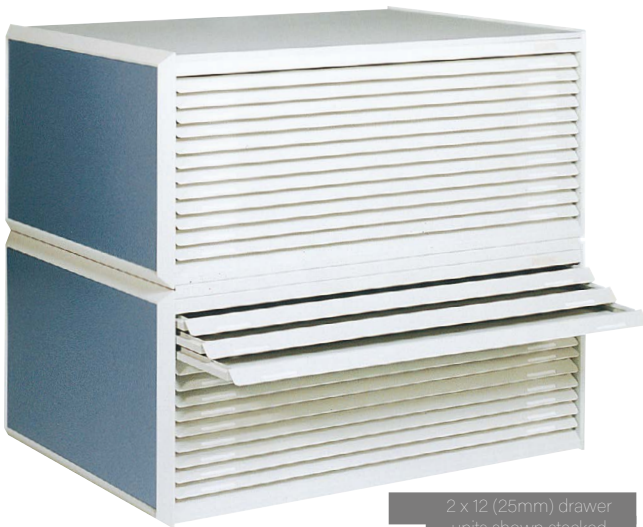
2 x 12 (25mm) drawer units shown stacked